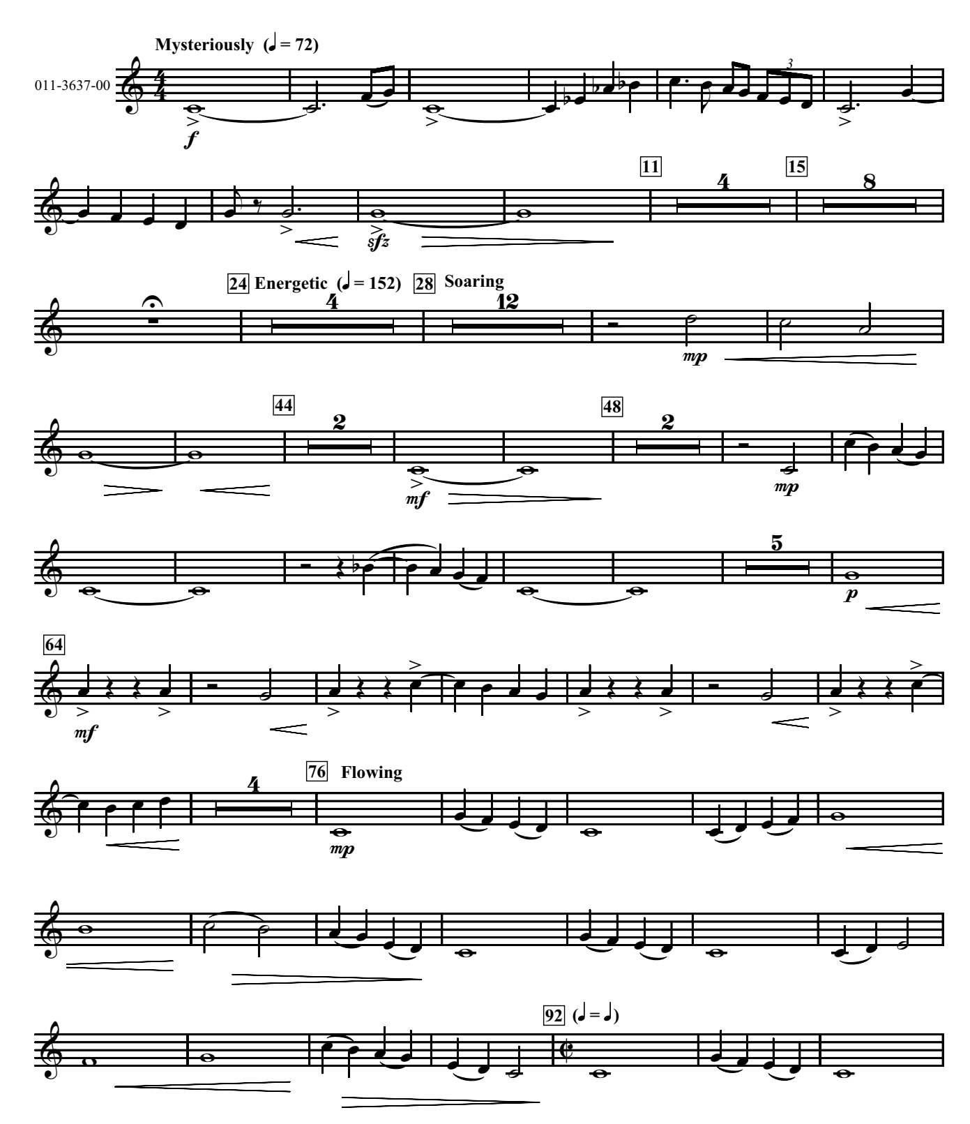
© 2007 Birch Island Music Press (ASCAP), P. O. Box 680, Oskaloosa, Iowa 52577 USA International Copyright Secured. All Rights Reserved. Printed in U. S. A. Warning! This composition is protected by copyright law. To copy or reproduce it by any means is an infringement of the copyright law.