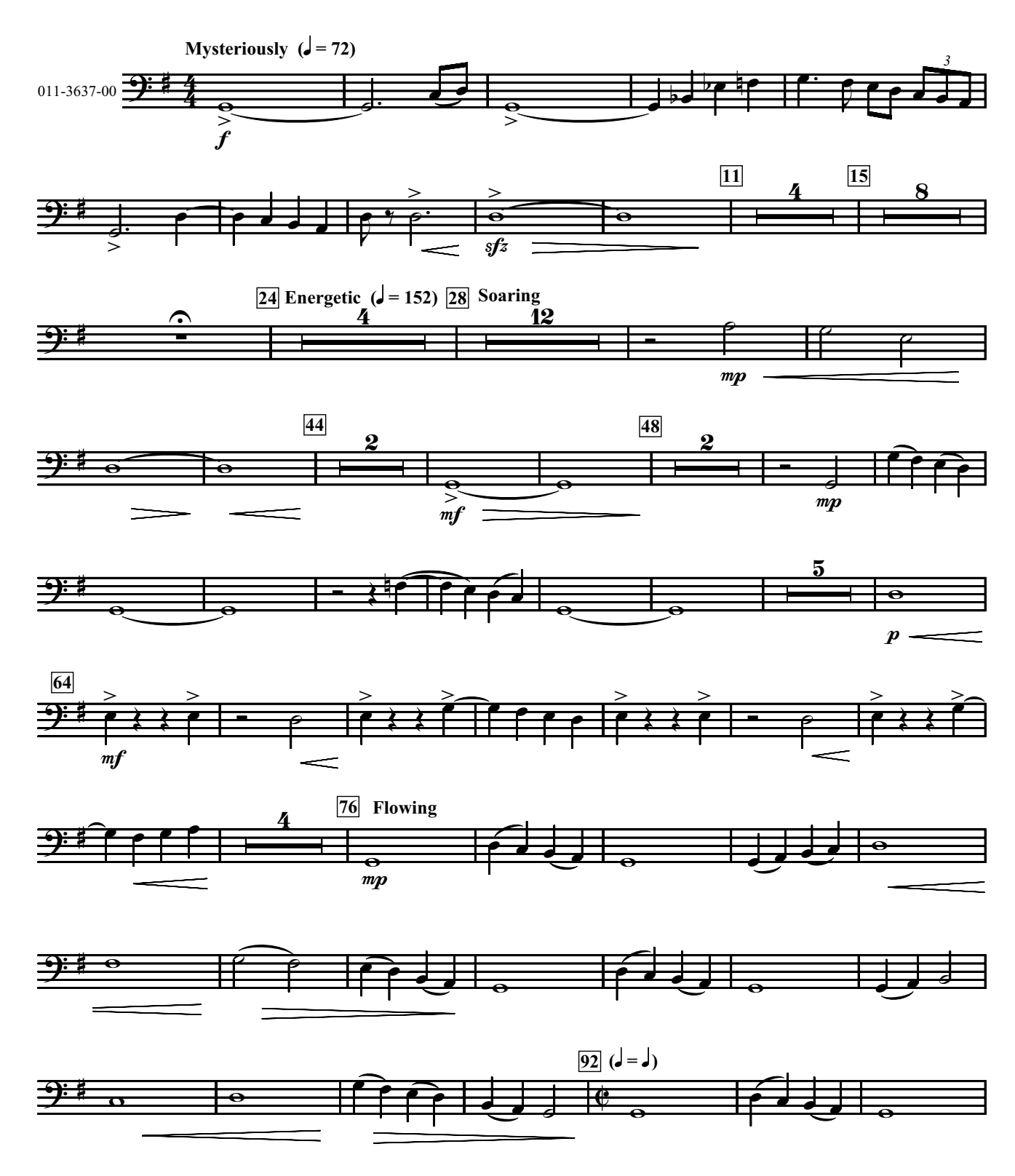
© 2007 Birch Island Music Press (ASCAP), P. O. Box 680, Oskaloosa, Iowa 52577 USA International Copyright Secured. All Rights Reserved. Printed in U. S. A. Warning! This composition is protected by copyright law. To copy or reproduce it by any means is an infringement of the copyright law.