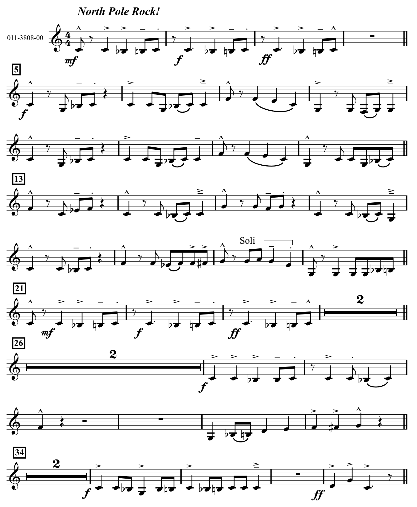
© 2009 Birch Island Music Press (ASCAP), PO Box 680, Oskaloosa, IA 52577 International Copyright Secured. All rights Reserved. Printed In U.S.A. WARNING! This composition is protected by copyright law. To copy or reproduce it by any method is an infringement of the copyright law.