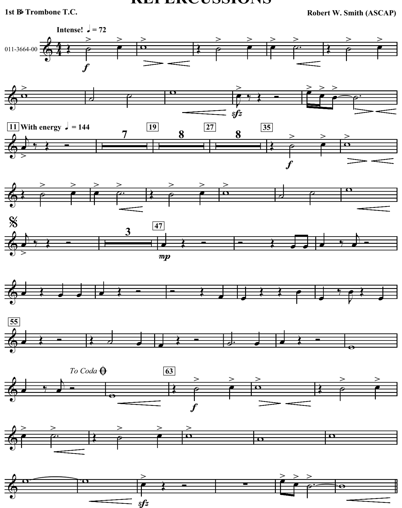
2007 Birch Island Music Press (ASCAP), P. O. Box 680, Oskaloosa, Iowa 52577 USA International Copyright Secured. All Rights reserved. Printed in U. S. A. WARNING! This composition is protected by copyright law. To copy or reproduce it by any means is an infringement of the copyright law.

Commissioned by and dedicated to the Lancaster Band Boosters for the Lancaster City Schools Instrumental Music Department on the occasion of the 2007 All-City Band Program, Lancaster, Ohio.