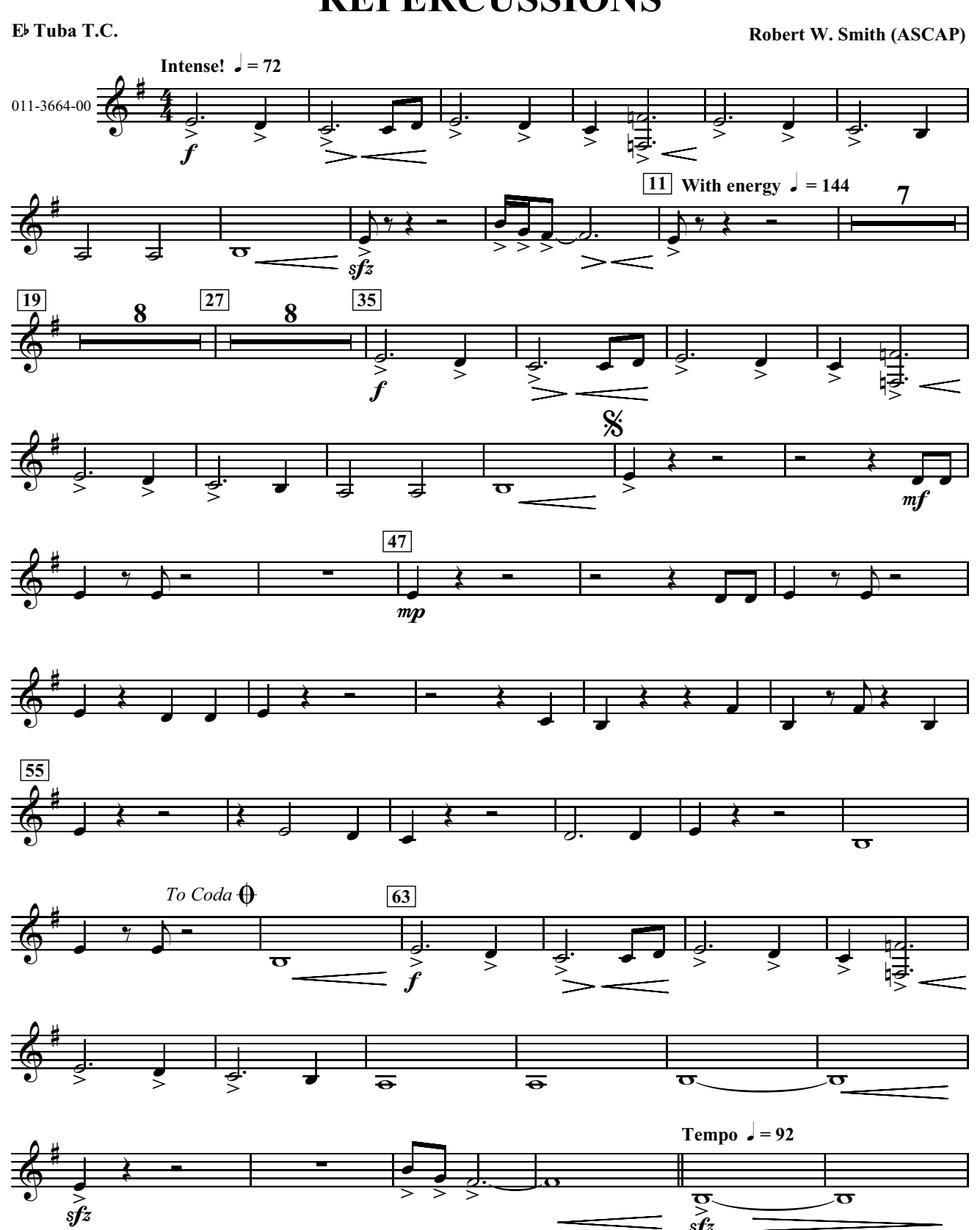
2007 Birch Island Music Press (ASCAP), P. O. Box 680, Oskaloosa, Iowa 52577 USA International Copyright Secured. All Rights reserved. Printed in U. S. A. WARNING! This composition is protected by copyright law. To copy or reproduce it by any means is an infringement of the copyright law.