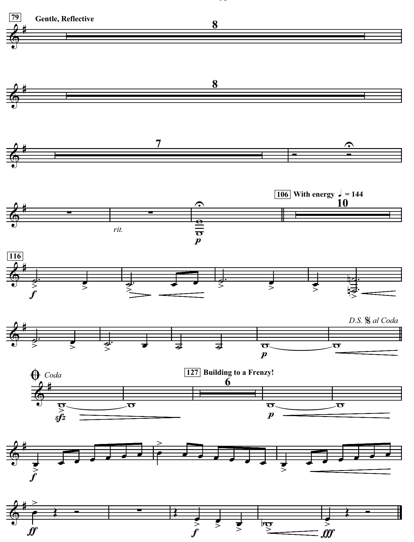
E Tuba T.C. - pg. 2