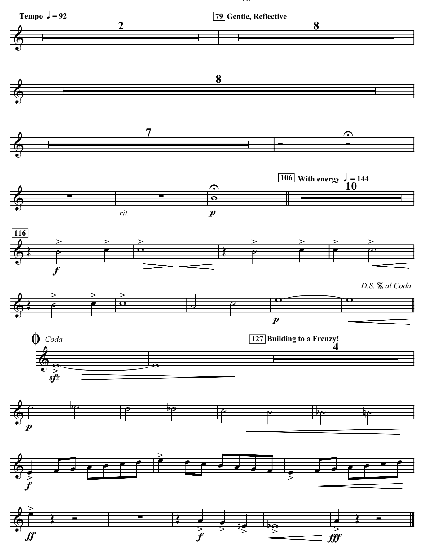
1st B Trombone T.C. - pg. 2