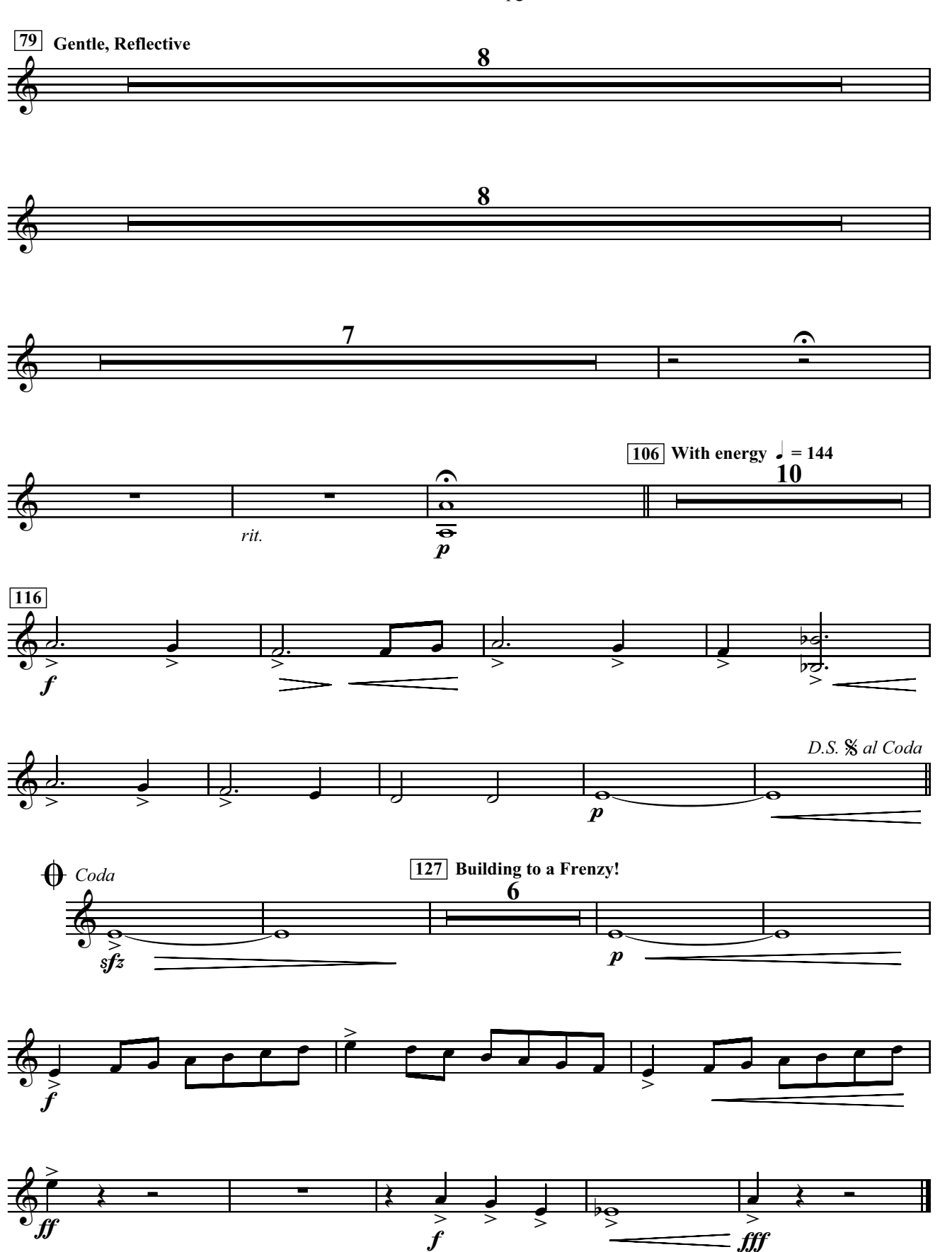
Bb Tuba T.C. - pg. 2